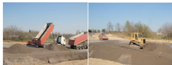
Fig. 5 Construction of ring road of city of Chrzanow using the aggregate-binder blend from Sobieski Mining Company.

The installation launched in June 2011 in the Sobieski Mining Company produced, by the end the 2011, 66 000 tons of blends with the adds-on of various types of ash for the purpose of road construction – Fig. 5. About 56 000 tons of mining waste and about 10 000 tons of FBC ash was managed in this way. The results of such activities are, inter alia, economic effects in the form of revenues from the sale of blends, as well as savings resulted from avoided costs associated with mining waste and ash storage.