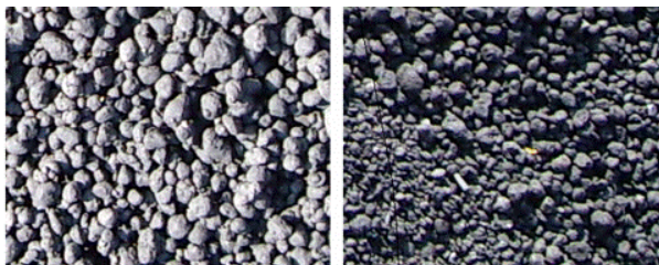
Fig. 2. Granulated coal slimes with the content of FBC ash.

The conducted research, as well as the conditions established for the application of ash containing active compounds of calcium instead of quicklime or hydrated lime became the basis for filing a patent application [7]. In this way, for coal slime granulation not only the typical calcium binders are used but also FBC ash and calcium type of ash – Fig. 2.