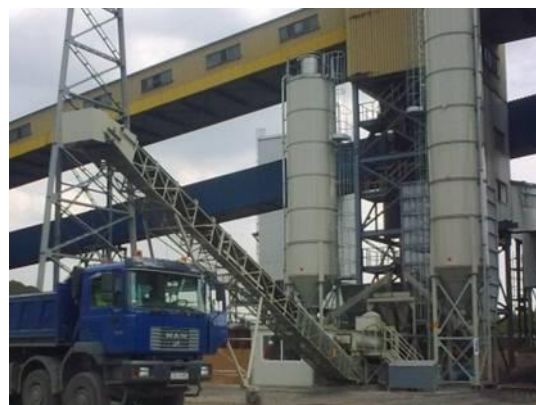
Fig. 4. Installation for the production of aggregate-ash blends in Sobieski Mining Company.

Simultaneously, a procedure for purchase of installation for continuous production of aggregate and ash blends was initiated. Among the several proposals an Italian installation (Ciepiela Technology Promotion Company) of continuous operation with a capacity of 150 tons of compound / hr. was chosen and installed – Fig. 4.