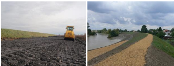
Fig. 6. The construction of dikes alongside the Vistula river using the „dried” aggregate with ash from Janina Mining Company.

Janina Mining Company is planning to launch a similar installation in 2012. However, in 2011 production and sale of aggregates made of waste rock of current production was already being carried out. To improve the geotechnical properties of produced aggregates and to increase sales the additional installation aiming at "drying" the aggregates by adding FBC fly ash was launched. In 2011 it produced about 130 000 tons of blends containing about 10 000 tons of FBC ash for the construction of dikes – Fig. 6.