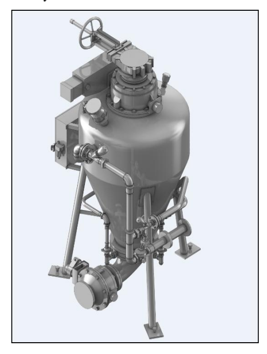
Fig. 1. CBD pneumatic pump type MD.

In this report, Table 1 shows some technical characteristics and images of CBD pneumatic equipment that was used in fly ash pneumatic conveying systems at Reftinskaya GRES.