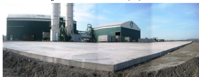
Fig. 3. Base plate with concrete produced with CEM II B-M (W-LL) – MUEG [17]

The cement was used to produce a base plate of 3000 m 2 at the site of MUEG. In total 660 m 3 of concrete with a cement content of 360 kg/m 3 with water/binder ration of 0.45 was placed. The concrete was placed as normal concrete and according the construction company no performance deviations compared to normal concrete was observed during concreting. On the base plate a hall was build and the plate is used by container trucks. After two years under service no cracks or damages have been observed [17].