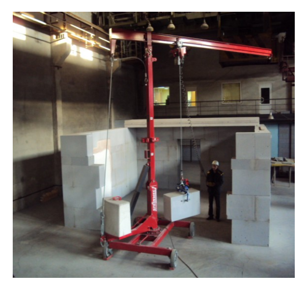
Fig.3. Assembling of the enlarged blocks by mini crane.