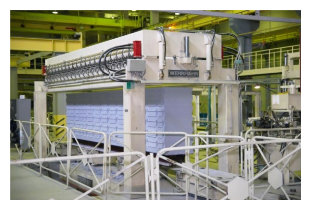
Fig.2. The technological line for production of autoclave cellular concrete.

The technology of production and use of enlarged twinblocks of autoclave cellular concrete was developed in association. They differ from traditional blocks by large size (table.2): length of products is 1500 mm, height 625 mm, depth 400 mm.